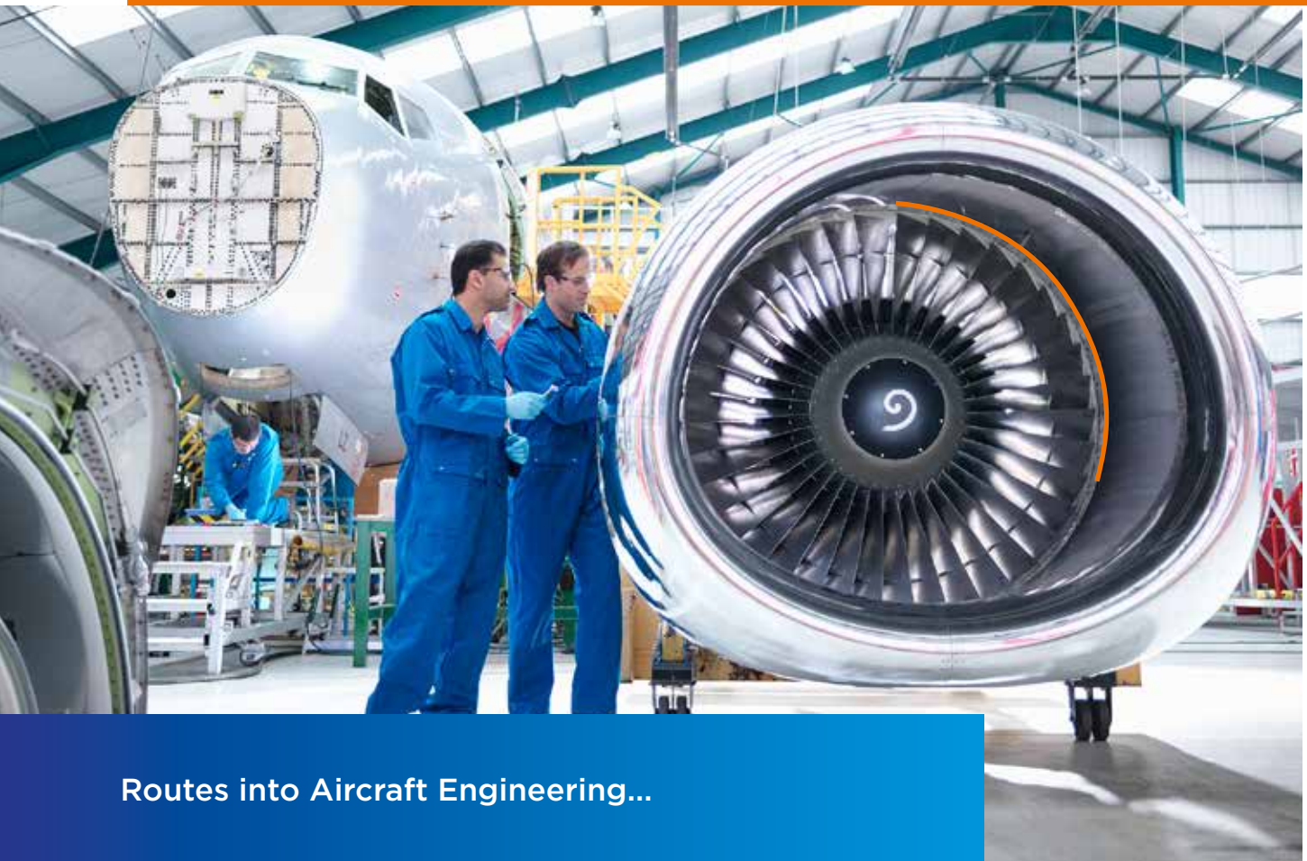
AFI KLM E&M - Adaptiveness® - October 2018 - Design: LOVE IT